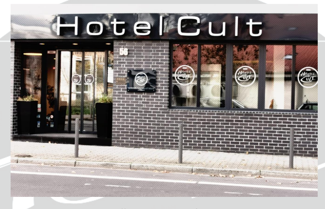
Offenbacher Landstraße 56